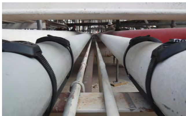
Figure 5. Standard SmartPads installed in a chemical plant in the Gulf of Mexico.