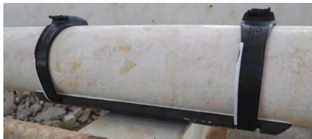
Figure 4. Installed SmartPad with Teflon (white) strips to protect it from highly-corrosive chemicals.