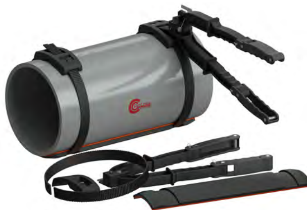
Figure 3. RedLineIPS SmartPad System components.