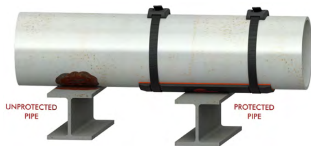
Figure 2. Installed RedLineIPS SmartPad protects piping from external corrosion.

inexpensive visual inspection for corrosion, instead of relying on more expensive inspection methods such as radiography, lasers, X-ray, etc.